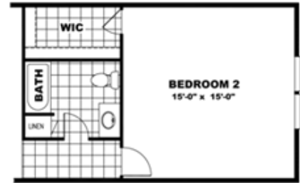
DUAL MASTER SUITE OPT.

Our home building facilities invest in continuous product and process improvements. Plans, dimensions, features, materials, specifications and availability are subject to change without notice or obligation. Renderings and floor plans are representative likenesses of our homes and may differ from the actual homes. We invite you to tour a Home Center near you and inspect the highest value in quality housing available or call (919) 570-3366 to speak with a Home Consultant. Copyright 2017, CMH. All rights reserved.